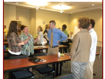
Piedmont Regional System staff and Friends—April 2014